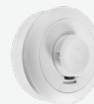
SMKT-900 Smoke/Heat/Freeze Detector