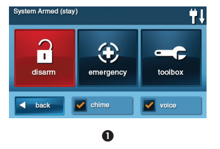
At the Security or Menu screen, tap Disarm.