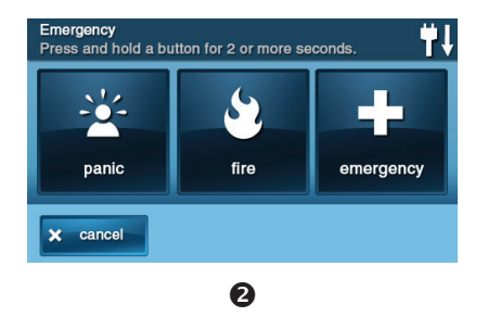
Press the Alarm button on the GC2e Panel.

Touch and hold the Panic, Fire or Emergency button for two (2) seconds.