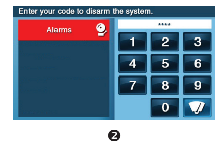
Enter your code to disarm the system.

TIP: If a false burglary alarm is activated while the system is armed (for example, someone inadvertently opens a protected door/ window) and you want to cancel or silence the alarm, see "If You Want to Cancel/Silence a False Burglary Alarm " on page 14.