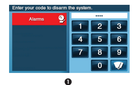
Enter your code to disarm the system.

1 Enter the premises through a designated Entry Delay sensor-protected door.